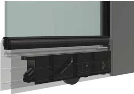
ALSPEC's high performance, commercial door roller used in the Carinya residential sliding door for smooth operation.

Carinya windows and doors: Commercially-bred. Clearly better.